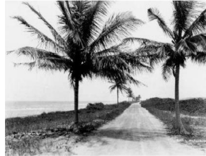
Ocean Drive, FL, 1926

Physical risks: direct impact of ESG factors