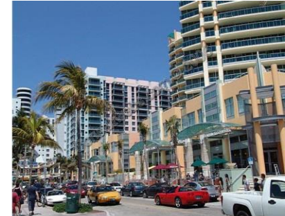
Ocean Drive, FL, 2010

Transition risks: economic dislocation and financial loss arising from transition to low carbon economy